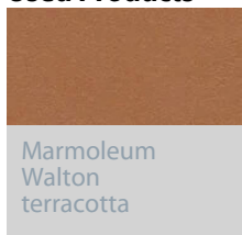
Marmoleum Walton terracotta